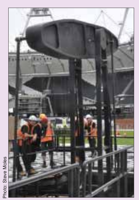
One of the beam engines for the Industrial Revolution sequence, provided by Stage One.

We take Heatherwick's drawings and from them create a simple MDF model. In essence, we pre-cut a series of contoured flat pieces, glue them together, and then a final machining to create the MDF petal former. It's like a shoe last that bespoke cobblers use. The tricky bit is working out the shape of the cut sheet of Copper required to be beaten into the shape for each petal last.