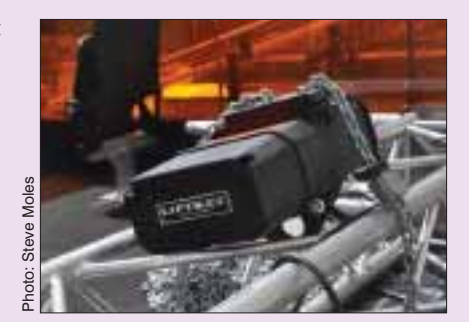
Around 300 hoists were employed by Unusual Rigging.

"Personally. I find the main catenary for the PA staggering. The cable is 65mm thick, the spokes to the roof are 25mm, all wound and then installed by a cable car company [Pfeifer]. It ends up with 22 pods of 2.5 tons each: the tension on the spoke cables, without load, is between 6 to 8 tons." Why the difference? "Because the stadium is an ellipse, the self-weight of the cable ring causes a deflection across the long to short sides of the ellipse; it might surprise you to learn that when all the PA and lighting is hung and deaded off to the main cable, some pods we calculated will be 1.1 metres higher than others. Overall, the roof proper will deflect between 400 and 600mm."