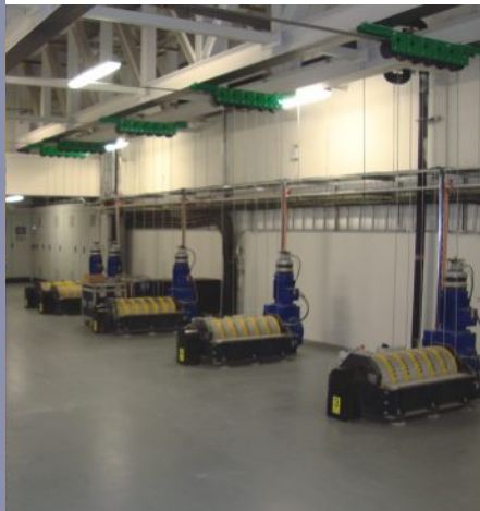
Fly tower - general view of grid and loading gallery

Client: John Sisk & Sons Scope: Full stage engineering fit-out View at: www.grandcanaltheatre.ie